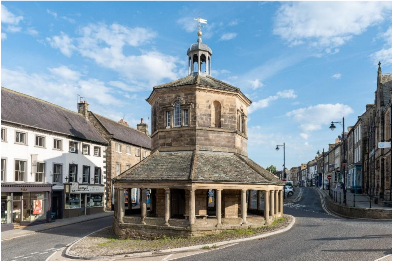
Butter Market (Market Cross), Barnard Castle