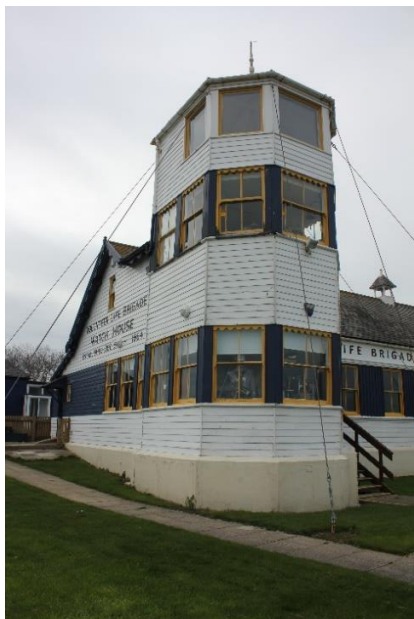
Tynemouth Watch House